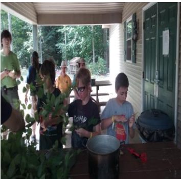
Cub Scout Summer Adventures